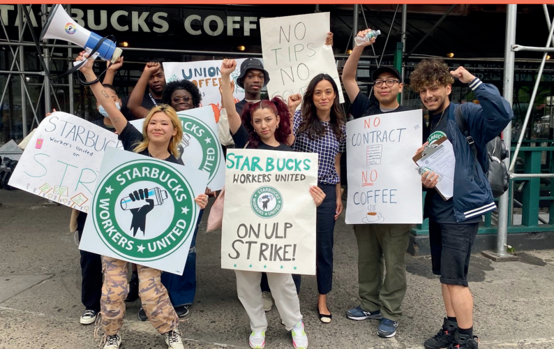
Workers at the Astor Place Starbucks went on strike in June to demand credit card tipping.